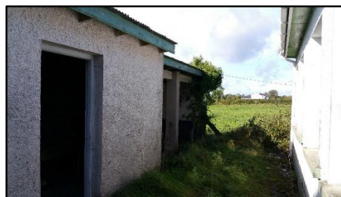
Rear outhouses/ stores