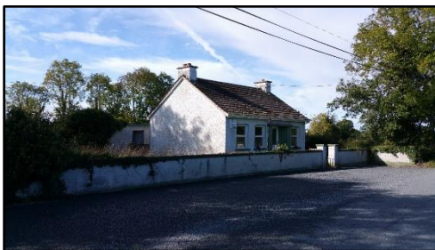
View from Whitehall NS